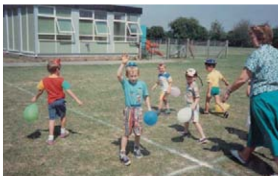
and looking back to Nursery 1990