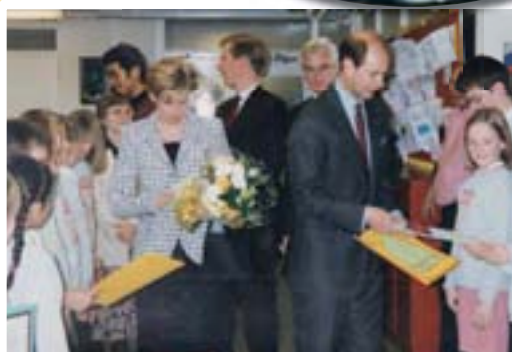
The Royals visiting Glebe

Over 21 years of Father Christmas arriving by helicopter, fondly known as the "Santacopter".