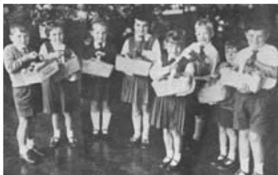
Harvest Festival 1964

Glebe children were invited, by Thames Television, to supply paintings to depict different types of weather. Every child in the school (250 at that time) painted a picture and 50 were shown as the background to the weather report. The paintings were part of Thames Television's colour presentation for viewers, although at that time the majority of viewers were still watching TV in black and white. The children were rewarded for their efforts with lunch and a tour round Thames' Kingsway studios.