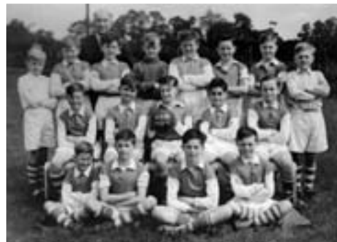
Glebe Football Team 1958

As part of the Coronation Celebrations for Elizabeth II a talent contest was held at Glebe in the main hall. I recited Skimbleshanks The Railway Cat by T S Elliot. The winner sang Maybe it's because I'm a Londoner.