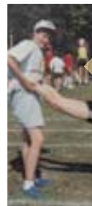
And another clue!