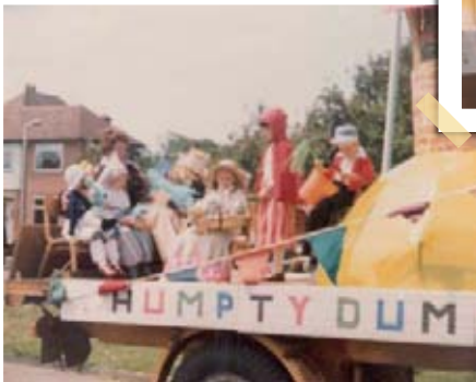
Winning Float - Ickenham Festival 1980

Ribbon dancing was entirely done as an after school club activity. This was almost exclusively a girls' activity with an occasional boy 'having a go'.