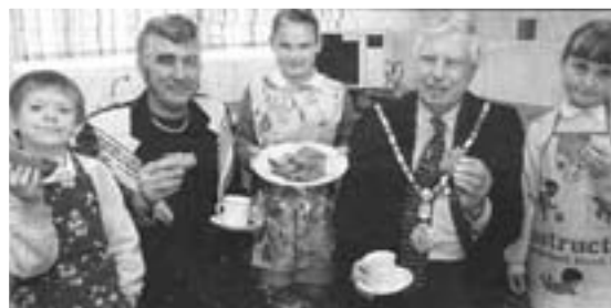
Mayor being served by the children