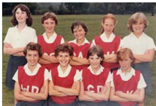
School Netball Team 1981

The PTA paid for the flagpole to be erected at the front of the school in the early 1980s.