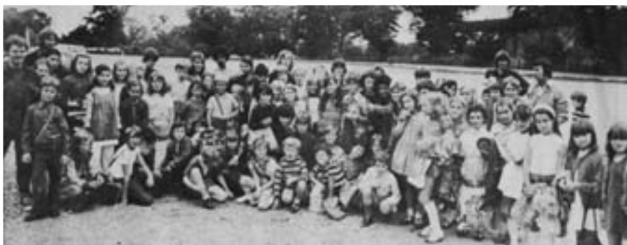
Children from Ickenham and Ruislip visit Windsor Safari Park 1973

The heating failed in November of 1974 so all the pupils were sent home early. That same day heavy rainfall caused the cellar to flood.