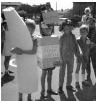
School Fete Fancy Dress 1971