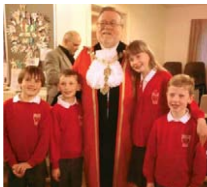
Mayor at St. Giles