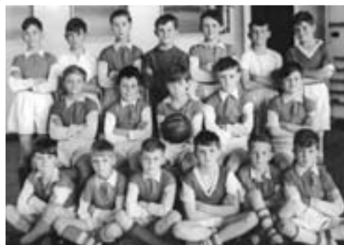
Glebe Football Team 1961