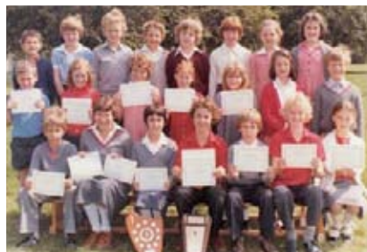
School Sports Team 1979

In summer 1972, the former newsreader, Richard Baker opened the school fete.