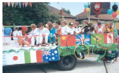
1992 Winning Olympic Float