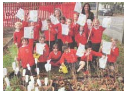
"Grow Your Own 2011" competition

Father Christmas arrived on a Fire Engine instead of the "Santacopter".