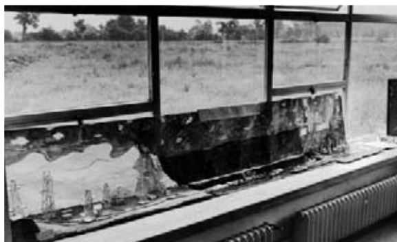
The 'meadow' from inside a classroom

To begin with, the field behind the school was just a meadow, too rough to be used for anything, but eventually I think machines came to flatten it and put down grass seed. They just left the bit at the far corner as a wild area for nature study. We did go on occasional nature study walks along Austin's Lane in the summer.