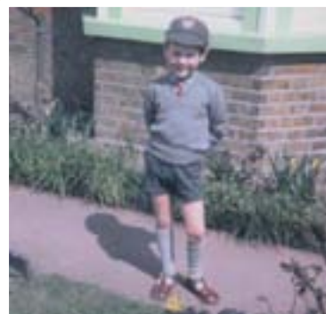
1st Day at School 1969

Comprehensive Education System initiated