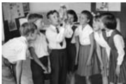
School Journey 1962