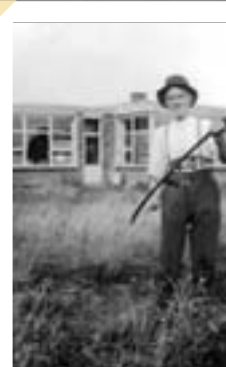
Cutting the grass