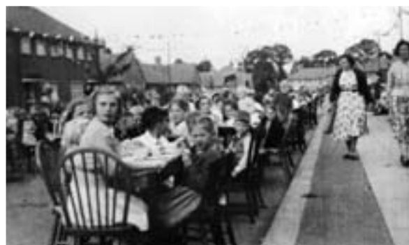
Street party 1952