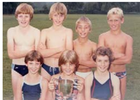
School Swimming Team 1981