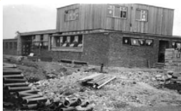
The building of Glebe School, early 1950s

On the day that the school opened the playground was not finished – a steamroller was laying tarmac as the pupils arrived.