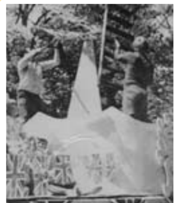
Tree problems with the Jubilee Float

In 1977, the Queen's Silver Jubilee year, Glebe won the prize for best float in the Ickenham Festival procession. It nearly didn't make it to the judging as it got entangled with a tree on the route from The Grove to Swakeleys Manor but a long-handled pruning hook came to the rescue and helped it on its way!