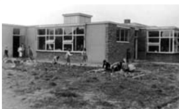
Gardening Club - 1950s style

We had country dancing in the Hall as well. There was a blue Dansette record player, on which the teacher would put 78 rpm records for us. Then there was a radio on which we used to listen to the schools' broadcasts (at 11 am I seem to remember), sitting cross-legged on the floor.