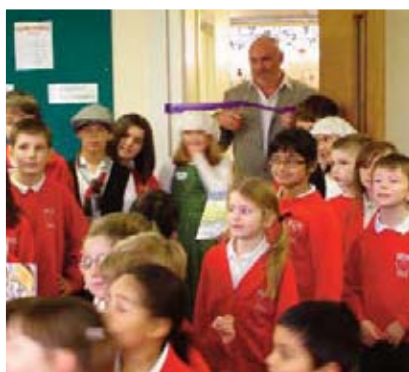
New Library opens