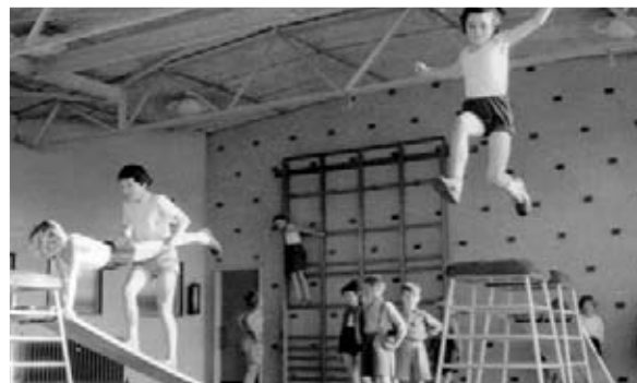
Gymnastics in the Hall

At 11 all pupils sat the 11 plus exam and only 2 pupils passed. All the boys that failed went to Abbotsfield Secondary School, and the girls to Swakeleys Girls School.