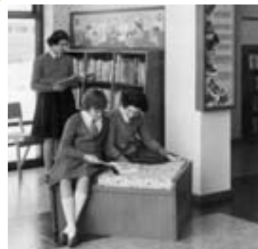
Ickenham Library 1967