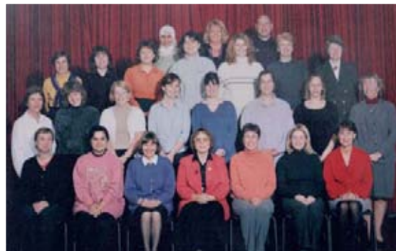
Teachers and Staff 1999

I remember arriving at school one morning and there were horses on the field - it caused a lot of excitement among the staff and children. They were eventually re-united with their owner.