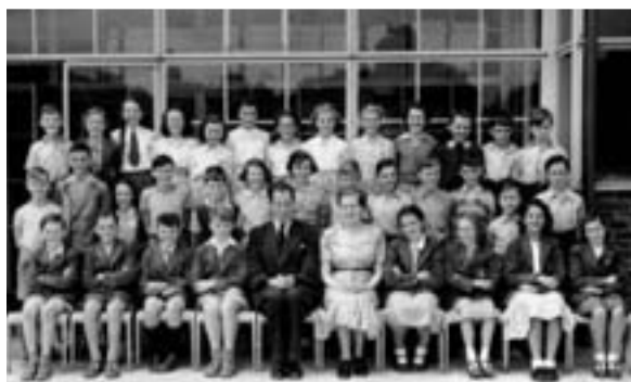
Class Photo 1952