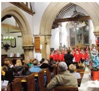
Christmas Choir at St. Giles Church