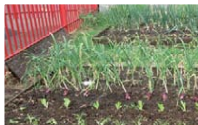
Glebe Gardening Club