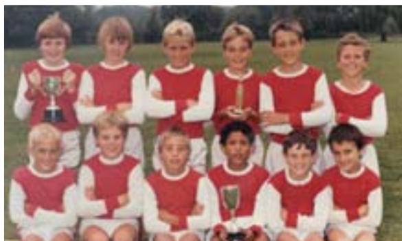
School Football Team 1981

On 12th May 1988 the school was closed for a day for work to be carried out on the main foul water and surface water drainage system underneath the school. Work was not completed until the end of October 1988 as asbestos was discovered and had to be removed.