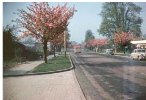
1960's, Junction of Community Close & Long Lane - looking towards Glebe Avenue

I can always remember starting school and having to be at the front in assembly but longing to be one of the "big girls" at the back. Funnily enough when I got older, I used to return to Glebe for the summer fete and on a couple of occasions came with fellow ex pupils of Glebe with our ponies, which we kept at Daltons Farm, and gave rides to the young children at the fete.