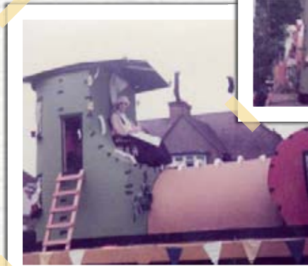
Winning Float - "Old Lady who lived in a shoe"

In November 1974 a cheese and wine evening was held for the parents of the new September intake, it was noted in the school journal as "an innovation in the PTA calendar".