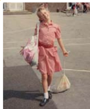
Who is this? - Last Day 1989