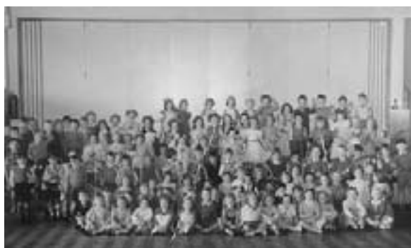
Pupils at Glebe School sometime in the early 50s.

The folding doors behind hid the dinner area and could be opened if necessary.