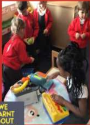
WE LEARNT ABOUT HEALTHY EATING