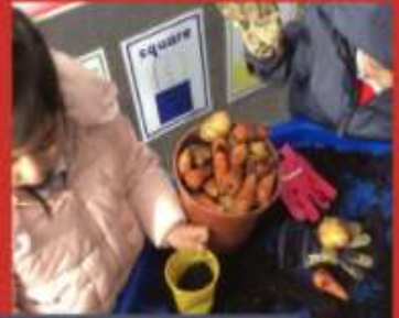
WE HAVE HAD A VERY BUSY WEEK IN NURSERY