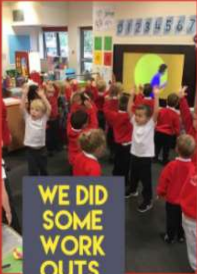
WE DID SOME WORK OUTS.