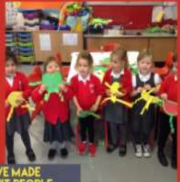
WE MADE FRUIT PEOPLE