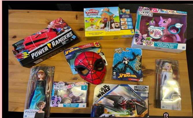
Years 1 & 2