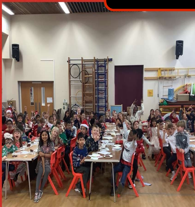
We had our Christmas party on Thursday. We danced and ate lots of pizza!