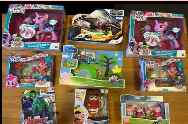
Nursery & Reception

Please don't forget that everything we raise goes straight back into school to enhance your children's experiences.