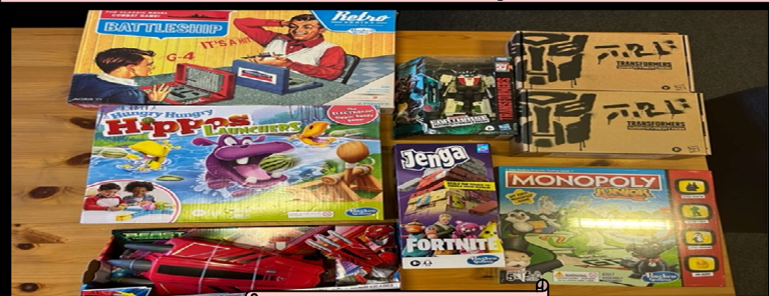
Years 3 - 6