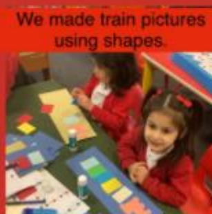
We made train pictures using shapes.