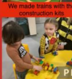
We made trains with the construction kits