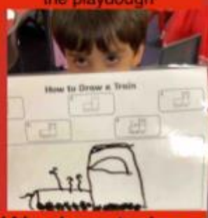
We drew trains