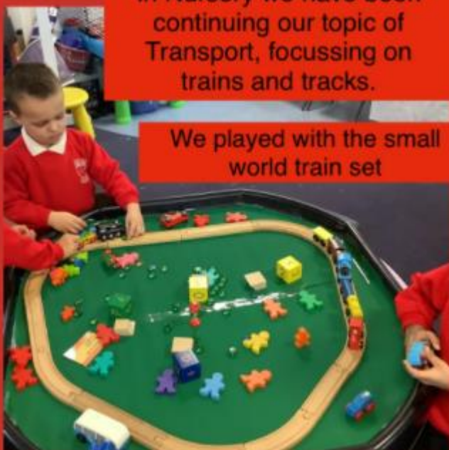
In Nursery we have been continuing our topic of Transport, focussing on trains and tracks.