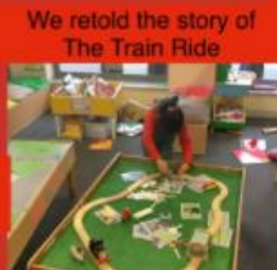
We retold the story of The Train Ride