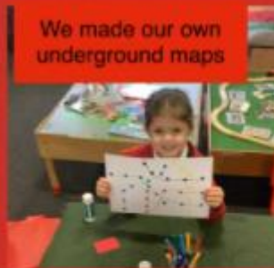
We made our own underground maps