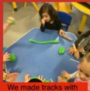
We made tracks with the playdough