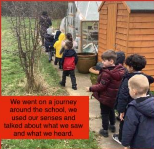
We went on a journey around the school, we used our senses and talked about what we saw and what we heard.