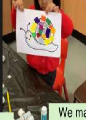
We made pictures of snails.