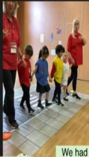
We had pedestrian training and learnt how to cross the road safely