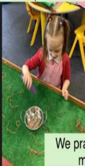
We practiced our fine motor skills