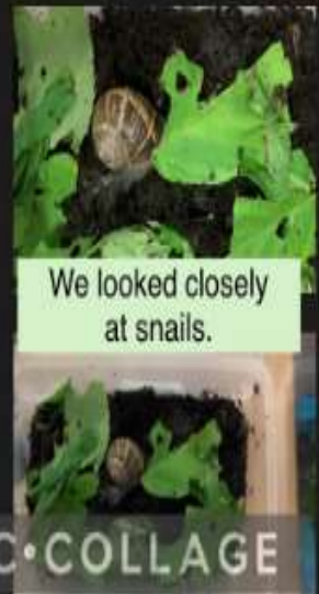
We looked closely at snails.