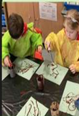
We made worm pictures with paint and wool