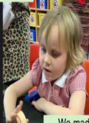
We made 3d snails