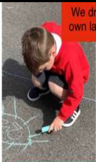
We drew our own ladybirds