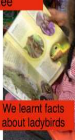
We learnt facts about ladybirds