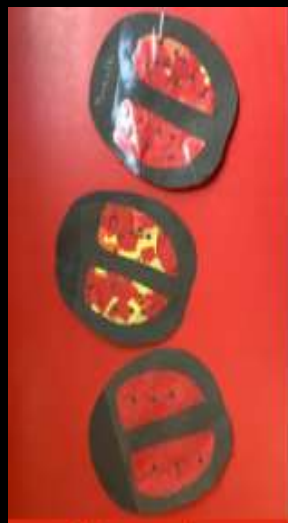
We made ladybird pictures