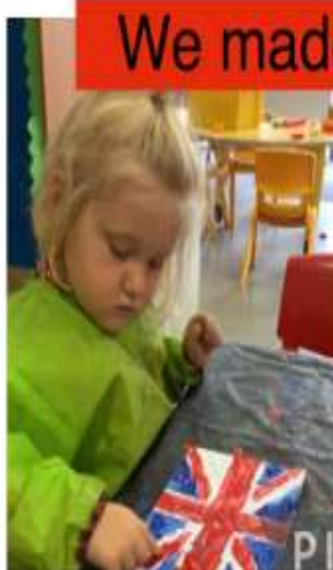
We made flags