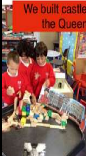
We built castles for the Queen