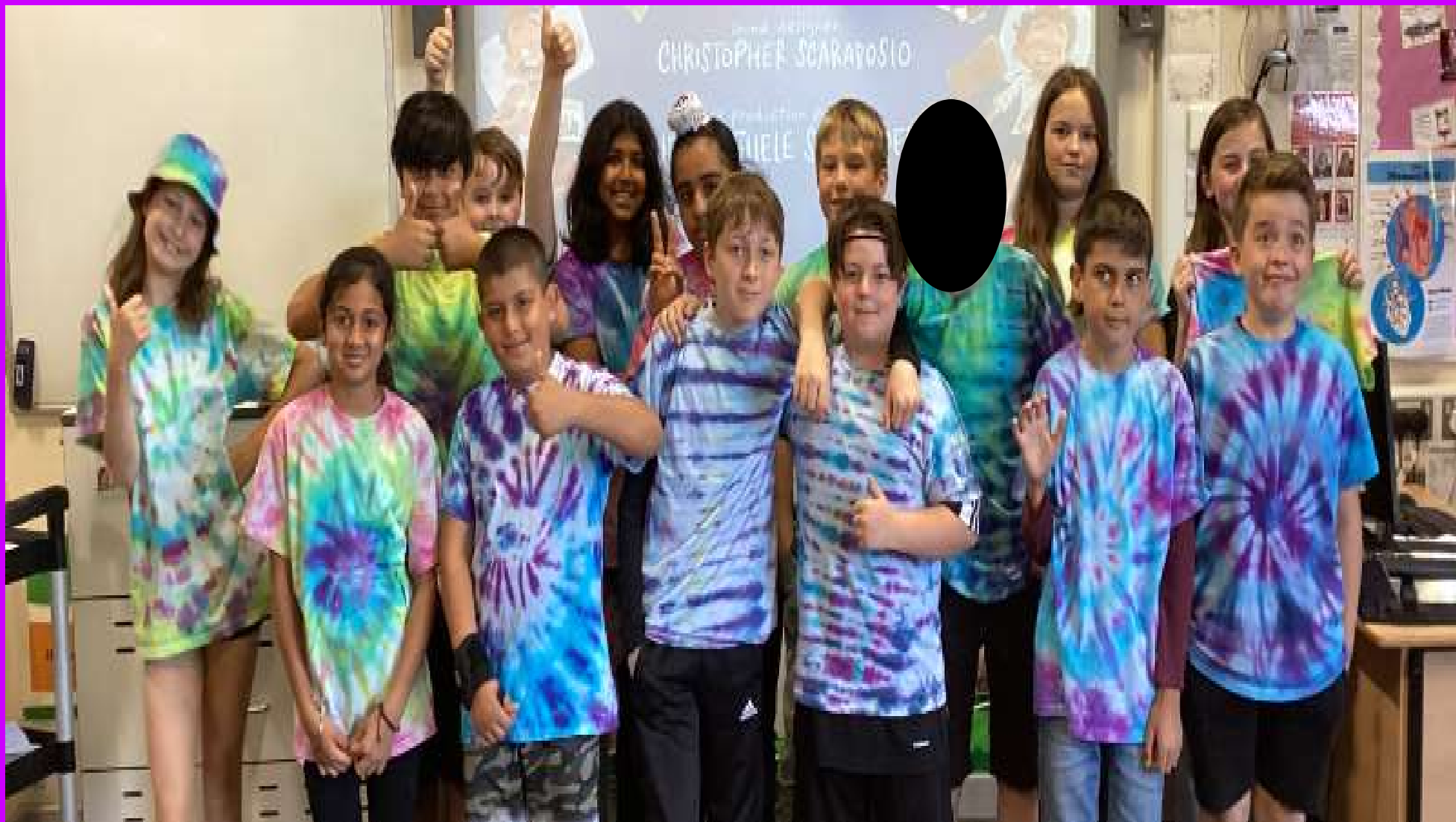
Year 6 in their tie-dye creations