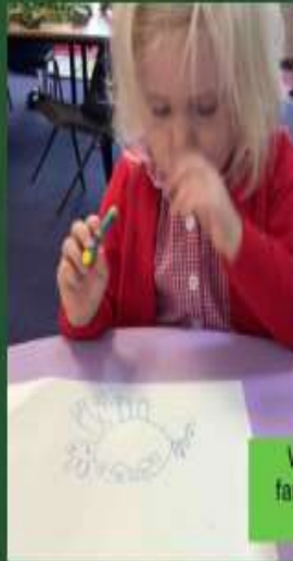
We drew some fantastic dinosaur pictures