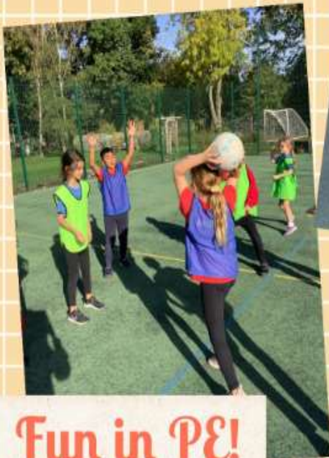
Fun in PE!