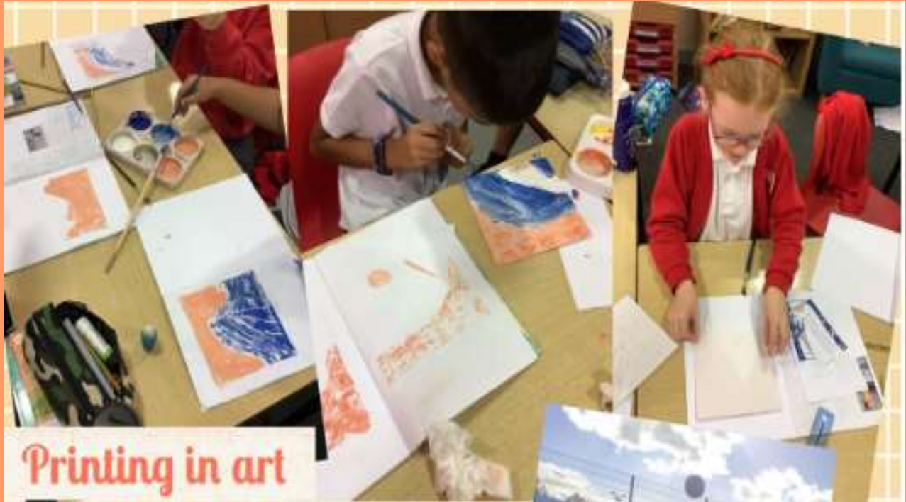
Printing in art