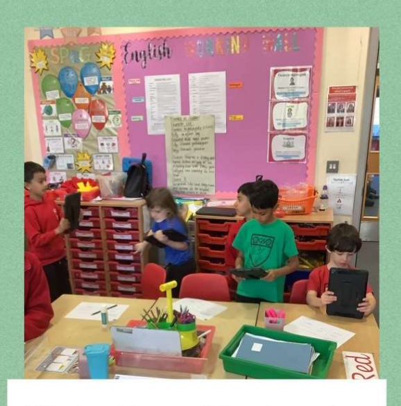
We had lots of fun learning how to use devices to take photos in computing.