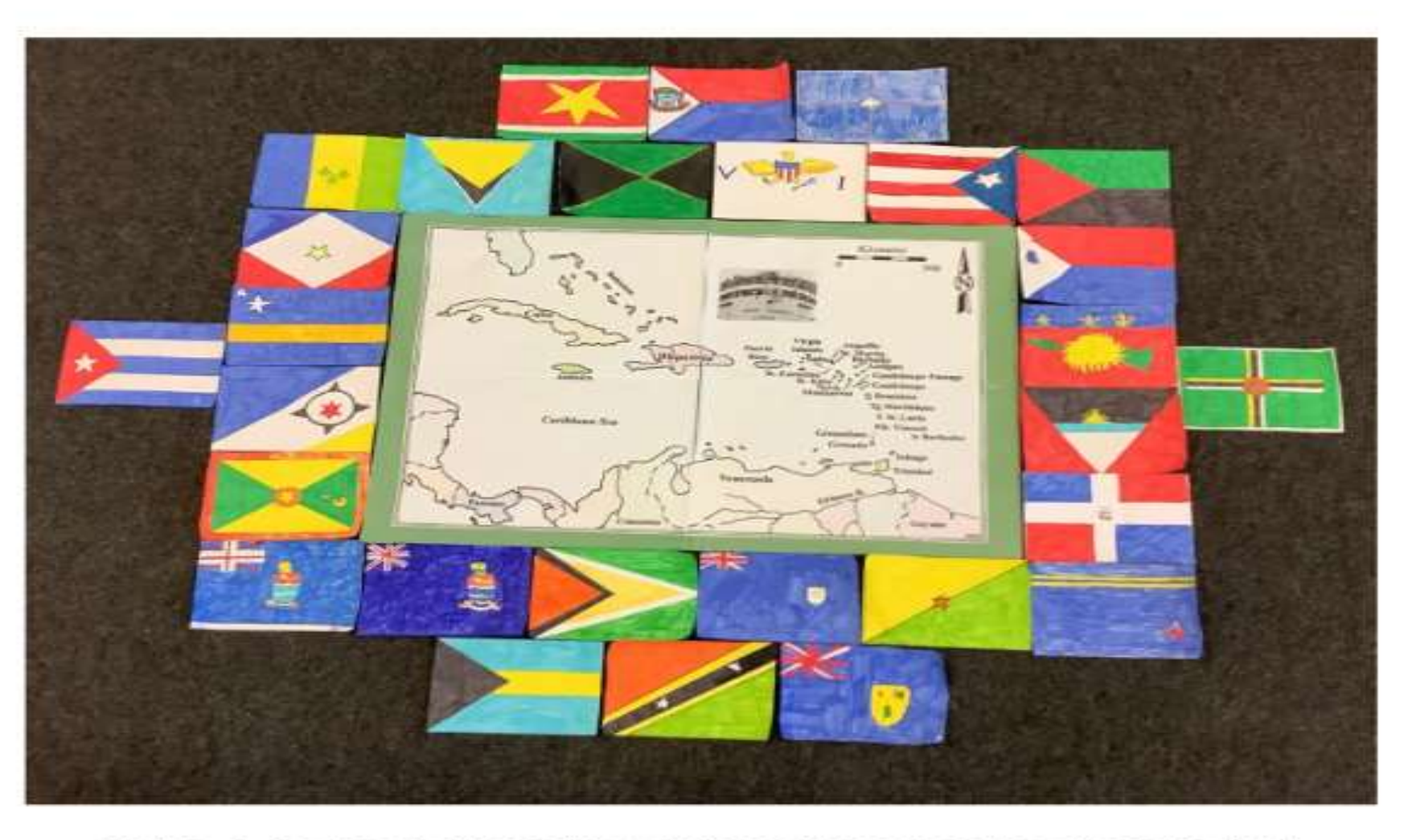
YEAR 6 LEARNT ABOUT THE WINDRUSH GENERATION