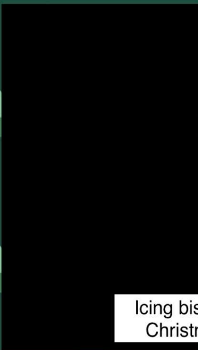
Icing biscuits for the Christmas Fayre!