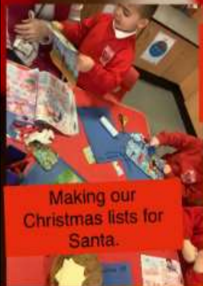
Making our Christmas lists for Santa.