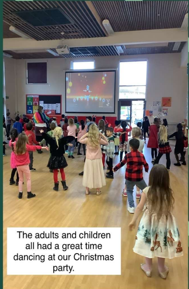
The adults and children all had a great time dancing at our Christmas party.