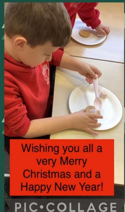
Wishing you all a very Merry Christmas and a Happy New Year!