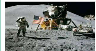
The first moon landing July 20 th 1969