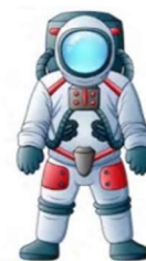
Astronaut Rocket Spaceship Blast off