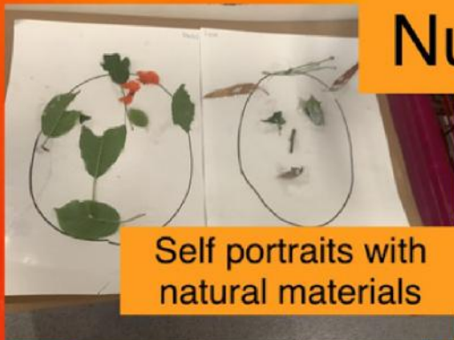
Self portraits with natural materials