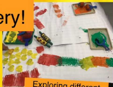
Exploring different textures using a variety of tools.