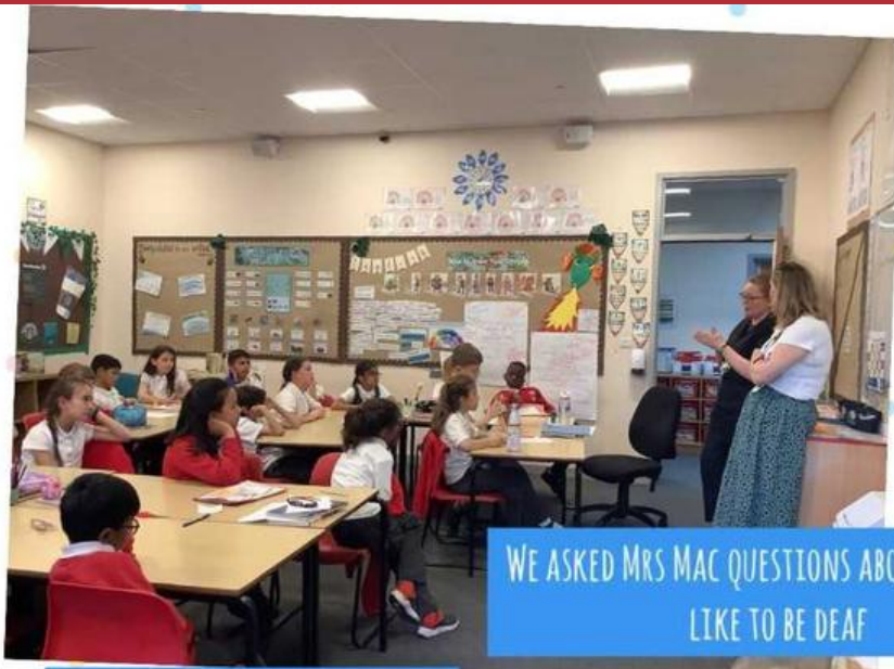
WE ASKED MRS MAC QUESTIONS ABOUT WHAT IT'S LIKE TO BE DEAF

CELEBRATING DEAF AWARENESS WEEK IN YEAR 4