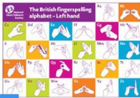
WE LEARNT HOW TO SIGN THE ALPHABET IN BSL

CELEBRATING DEAF AWARENESS WEEK IN YEAR 4