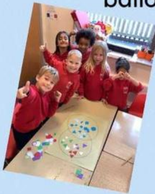
Sorting 2D shapes.