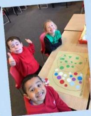
Using 2D shapes to make pictures.