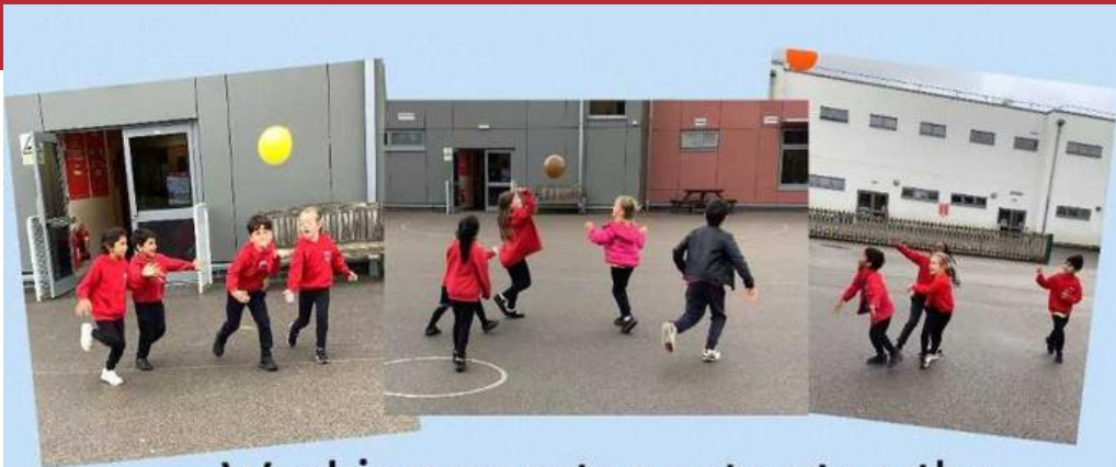
Working as a team to stop the balloon falling in the 'lava'.