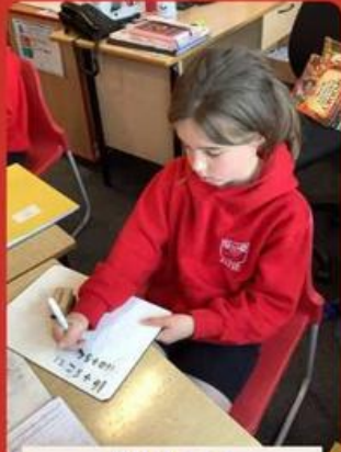
Making connections in Maths