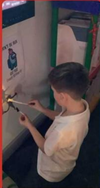
We made our own shadow puppets and explored how to use a torch to make shadows appear.