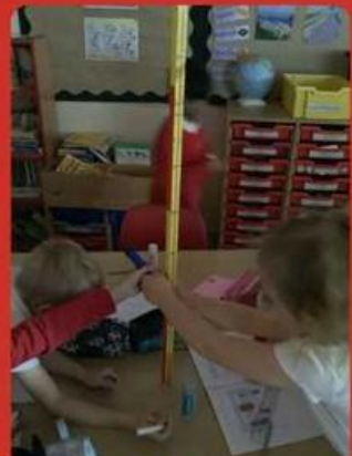
Measuring the lengths of shadows in our fun Science experiment.